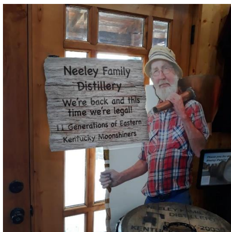
Neeley Distillery near Two Rivers

Please contact me if you are willing to fill the vacant position or volunteer for one or more months. HELP, Tri-State needs individuals to volunteer to host rallies in 2024, we have the months of July and August open. Pick your favorite campground, contact them now as they started booking January 1st of this year , and reserve 20 +/- campsites for Wednesday through Saturday night in your month. Please contact me with any questions and let me know when you are successful with the location, rates, dates, etc.