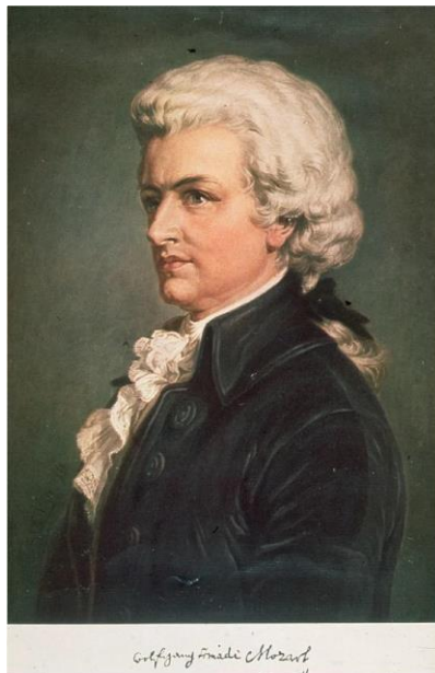
Wolfgang Amadeus Mozart circa 1789.