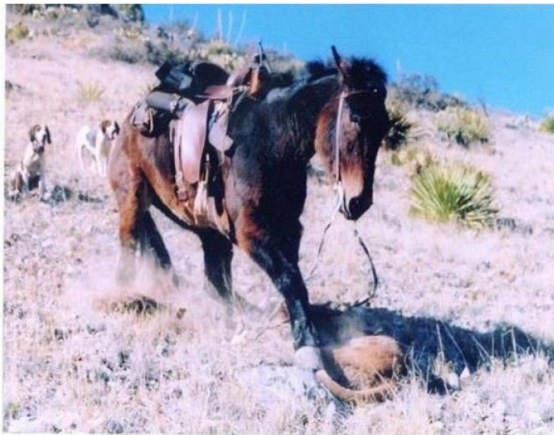
note the dog audience.... Gives new meaning to the phrase "BAD ASS"....

Now you know why many ranchers and farmers have mules in their fields.