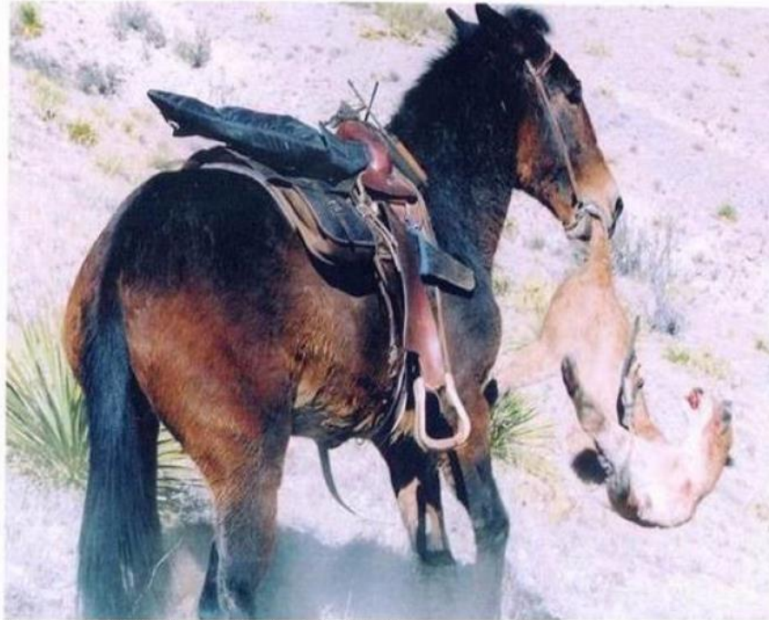
the cat was still alive here and trying to fight back