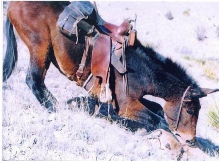
the mule stomped the cat then pinned it to the ground and bit the heck out of the dead cat several more times.